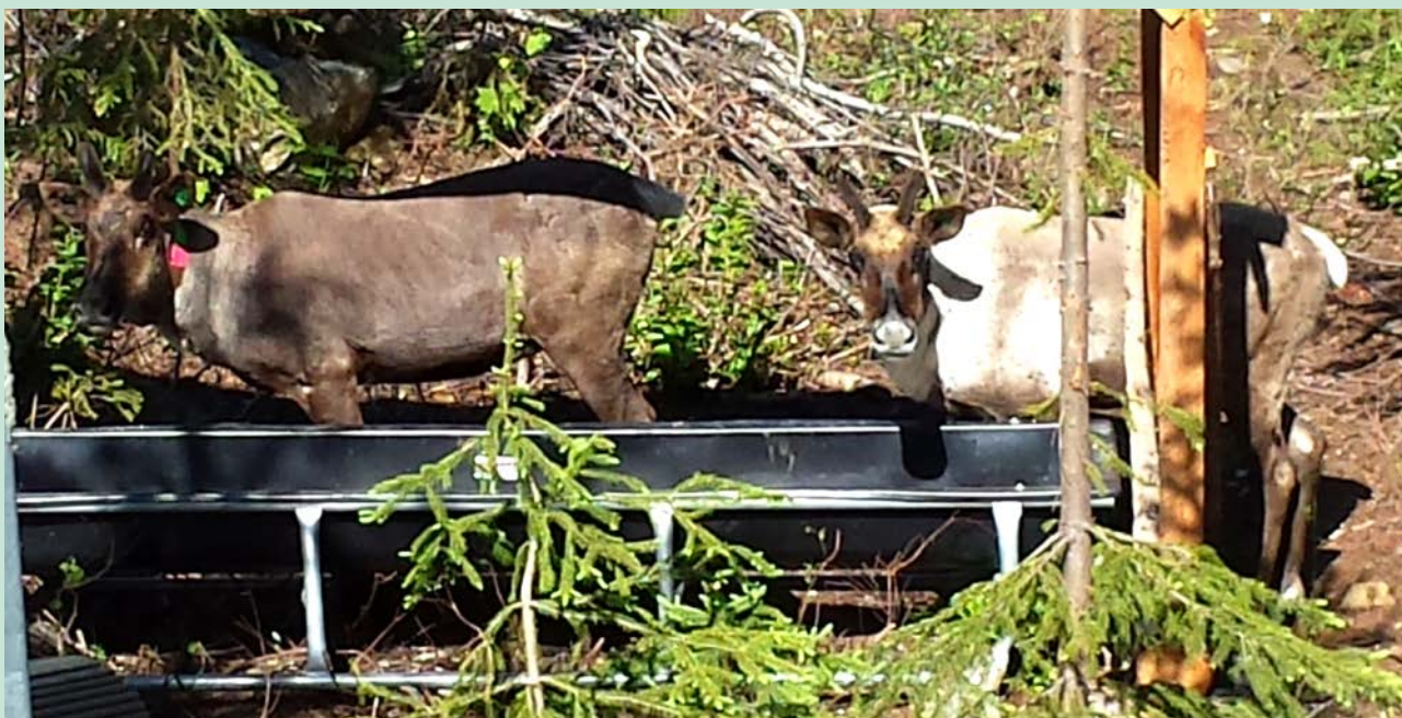
Revelstoke Mountain Caribou Rearing in the Wild: http://rcrw.ca/

Management review meeting minutes, Operations Management System, interviews and field inspections of following cutblocks: 279-1, 236-1, 241-1, 228-1, 205-2.